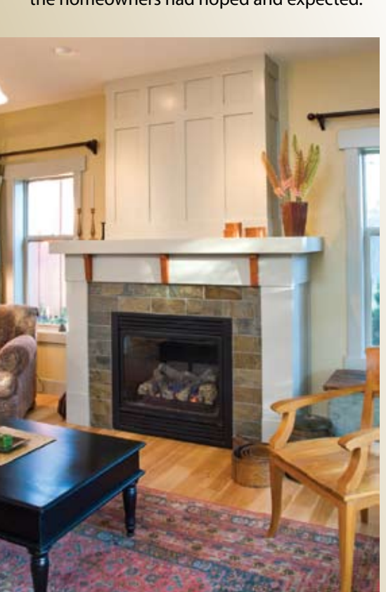
Familiarizing yourself with the architectural style of your home is key. Keep in mind that your home does not need to exhibit every aspect of a style in order to be considered part of a general style category. The architect or builder who designed your home may have used his own signature style that distinguishes his Ranch houses

Have you ever driven by a home that was remodeled without giving any consideration to the architectural style of the existing exterior? Perhaps the homeowners are very proud of their new addition in a contemporary style that features large walls of glass. Unfortunately, the addition looks disconnected from the rest of the house, which is of a completely different style. Because of this, the remodeling project actually devalued their home, rather than increasing its value as the homeowners had hoped and expected.