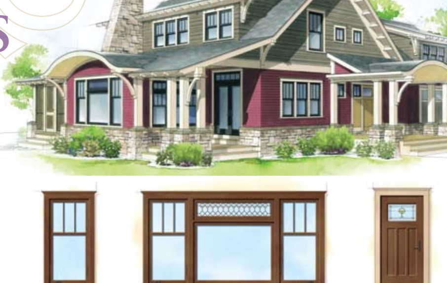
From Andersen Windows' Home Style Library

from all the others in town. The important thing is that when you renovate your home, you make every attempt—especially on the exterior—to be authentic to the original style, even while enhancing your home's amenities. This is true, even if all you are doing is replacing your windows with new high-performance windows for the purpose of saving money on your energy bill.