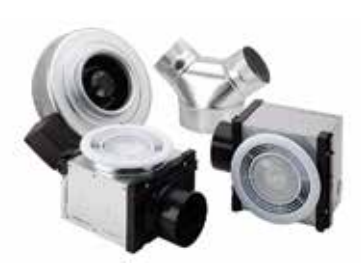
Fantech's remote mounted inline ventilation fans are quiet and efficient.