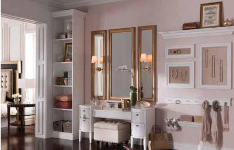
This clever accessory wall is made from Metrie French Curves moldings.