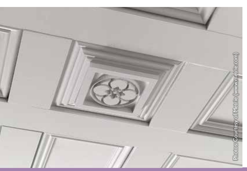
Painted moldings and rosettes create an elegant ceiling with a French Provincial feel.

There are a wide variety of trim styles to match the décor of your home, as well as your taste. Once you determine the architectural style of your home—whether Colonial, Craftsman, Contemporary or any one of a number of distinct styles—it will be easier to know which type of finishing materials to choose. You will want to create continuity throughout your home.