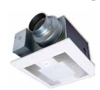
WhisperGreen Select fanllight offers options to fit your application: delay timer, humidity sensor, or motion sensor.

lighting. When selecting your fan, look for those that are Energy Star-qualified, which means they excel at level of performance, energy savings, and quiet operation.