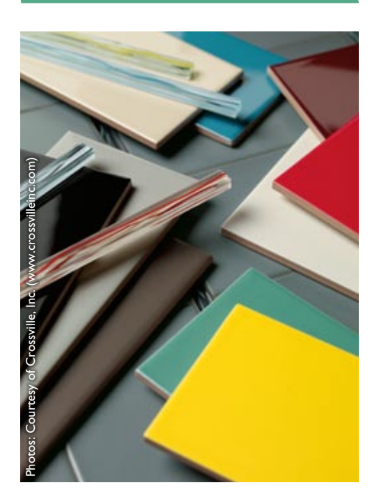
Color by Numbers wall tile by Crossville is Schirmeister's latest collection. For Color by Numbers, Crossville joined with Benjamin Moore® to offer coordinating Benjamin Moore Aura® paint selections; check out www.crossvilleinc.com/colorbynumberspaint.

The "natural" emphasis today is on raw materials and organic substances: earthy